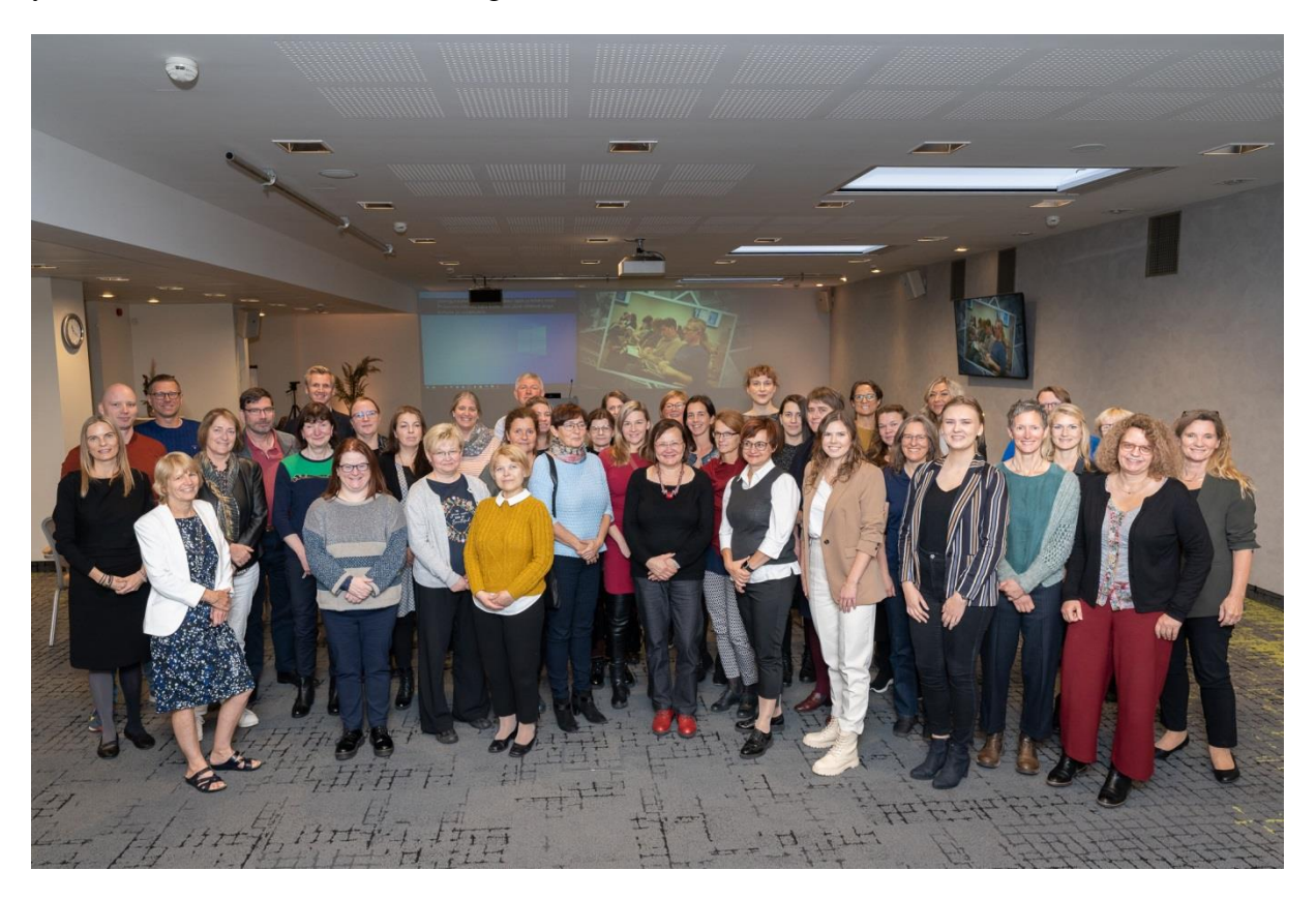
The participants of the congress

Thank you to all the participants and supporters for making the congress a success and see see you at the next, 27<sup>th</sup> FEAPDA congress in 2024.