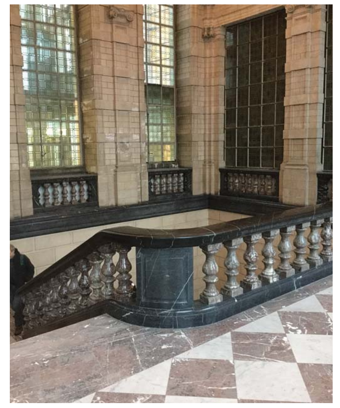
University of Leuven

As the conference drew to a close there was a wide-ranging discussion about the virtues and challenges of elearning. Delegates shared their experiences which highlighted such benefits as cost, speed, motivation, lower environmental impact, flexibility, and allowing the